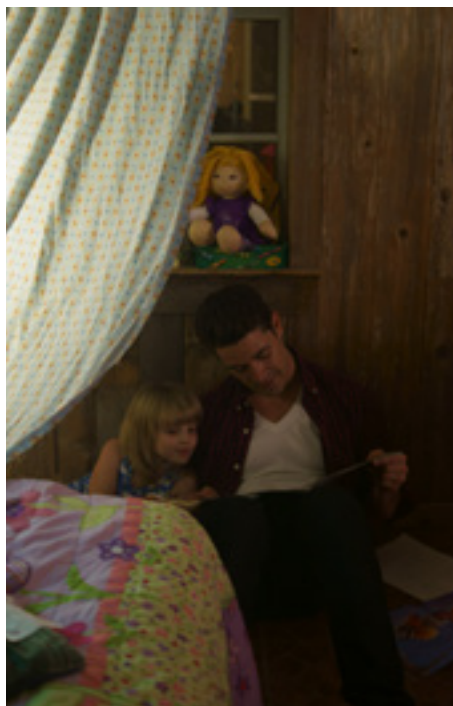
DOWNLOAD HIRES IMAGES AT VIRTUAL PRESS OFFICE